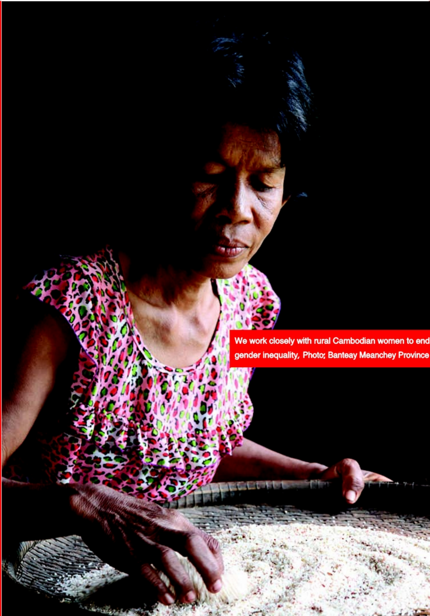
We work closely with rural Cambodian women to end gender inequality, Photo: Banteay Meanchey Province