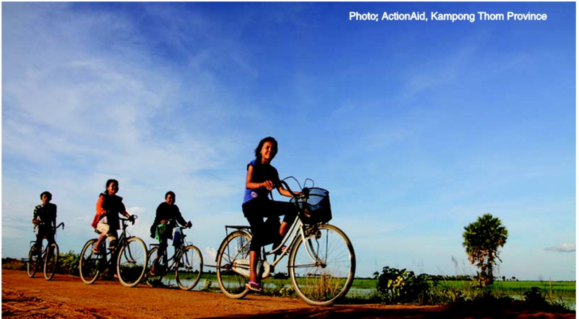
Kampong Thom Province